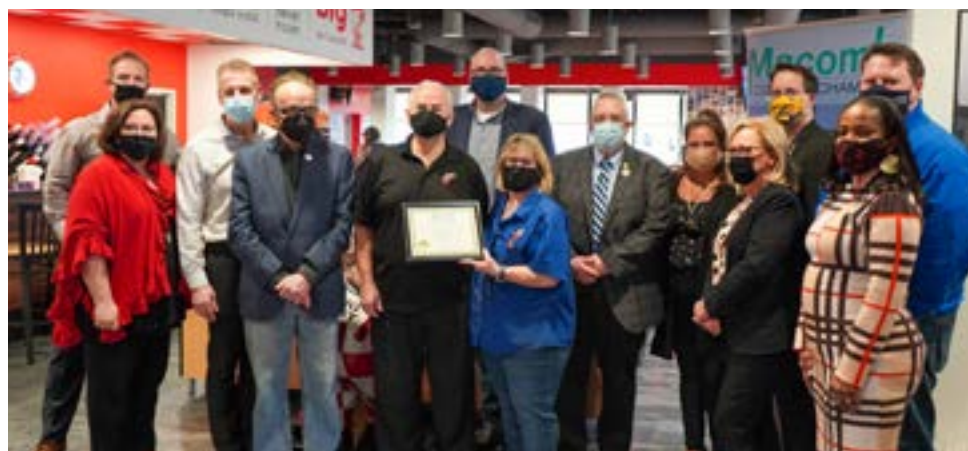
(Left: The Big Boy in Warren celebrated its reopening with a ribbon cutting ceremony hosted by the Macomb County Chamber on March 18, 2021)

Big Boy will celebrate its 85th anniversary later this summer.