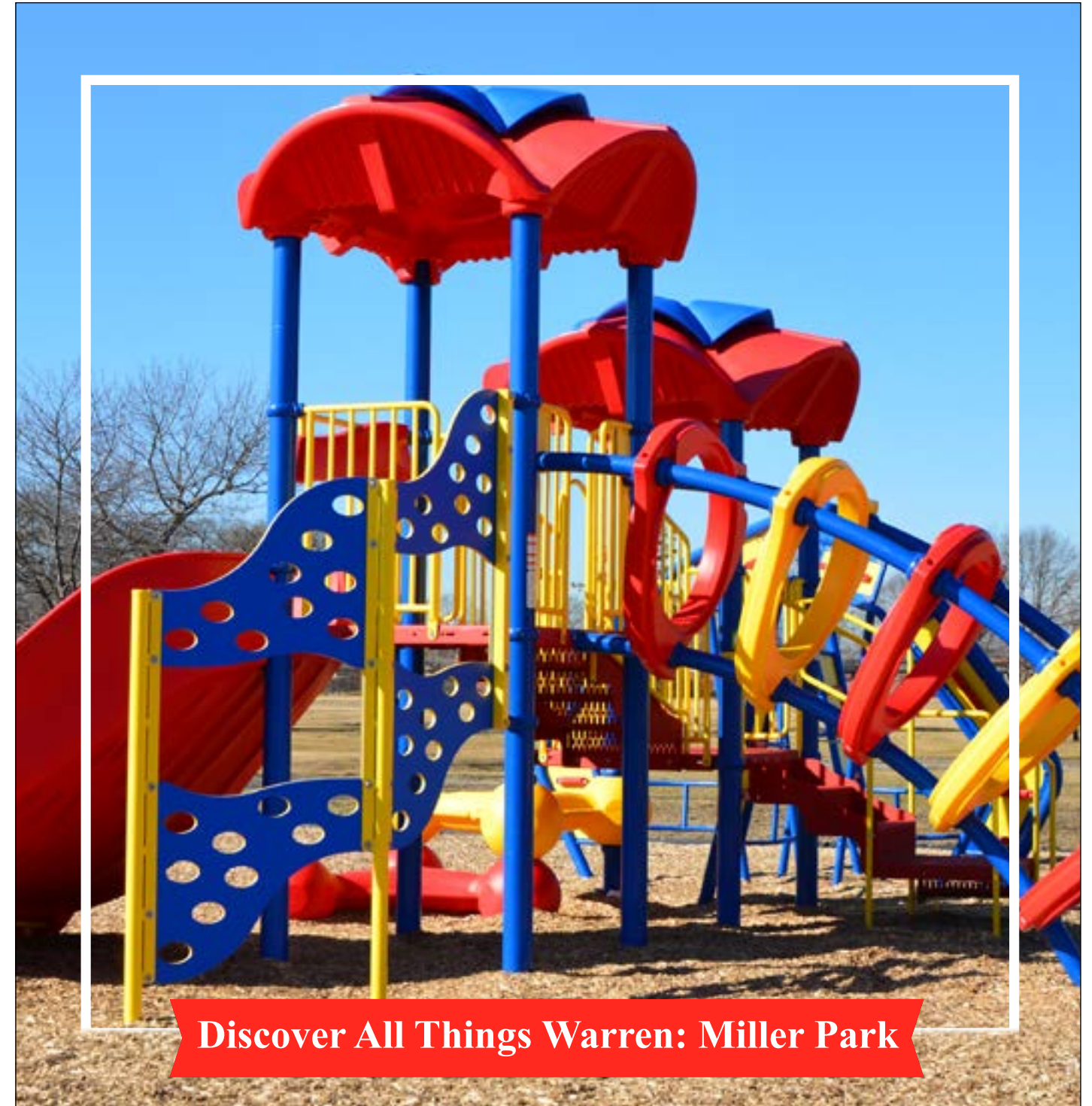
Discover All Things Warren: Miller Park

MIWarren.org is a website that connects you to all the exciting events and activities taking place in one of the most energized cities in Michigan. Whether you are a visitor or resident, we invite you to explore MIWarren.org and discover all the great things our beautiful city has to offer!