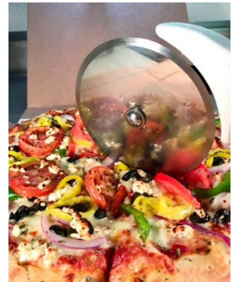
(Above: Cottage Inn Pizza has more than 30 toppings to choose from. Which combination is your favorite?)

To view a menu and order online, go to cottageinn.com .