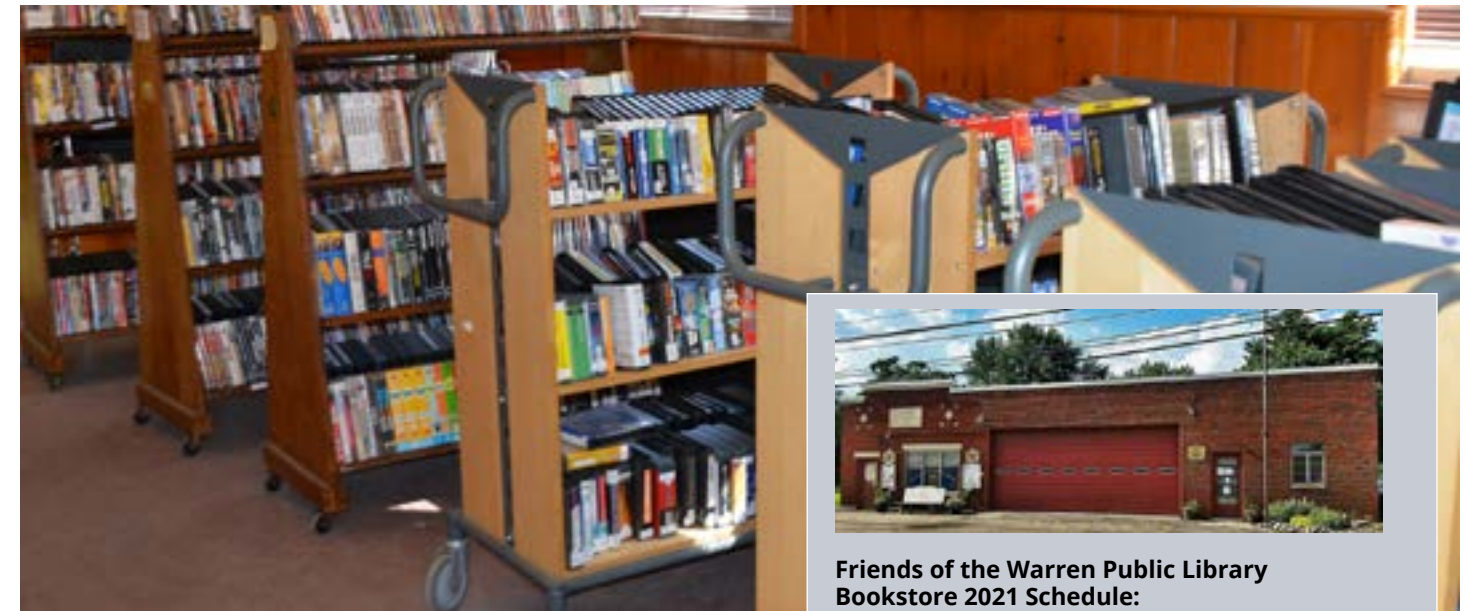
(Above: The Friends of the Warren Public Library is old Warren Village Fire Station at 5961 Beebe Street, one block north of 13 Mile Rd.,.)

Stop by and explore a vast selection of books - fiction, history, art, sports, children's, teens and more. You will be amazed at the variety and quality of books packed into this little store!