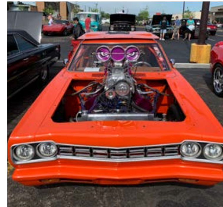
Click for more event photos from Cruisin'53 2019