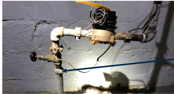
Lead Service typically has solder "bulb" characteristic at the plumbing connection

Review the information below to help you determine if you have a lead service!